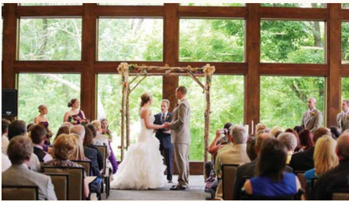
UPS GREAT ROOM