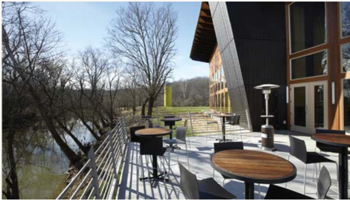
CREEK VIEW TERRACE