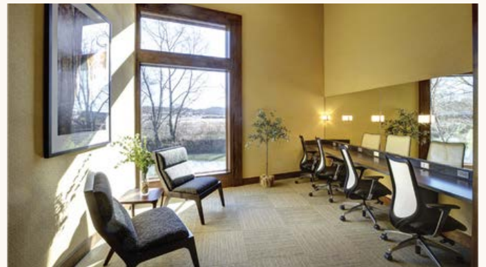
GREEN ROOM / DRESSING ROOM